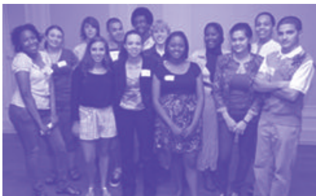
YOUTHadelphia is the Youth Advisory Committee of the Philadelphia Foundation's Fund for Children.

The PathWays PA Transitional Living Program (TLP) has received a $10,000 grant from YOUTHadelphia. As the Youth Advisory Committee of the Philadelphia Foundation's Fund for Children, YOUTHadelphia is comprised of teenagers who aim to cultivate leadership skills via philanthropic and civic engagement with the community.